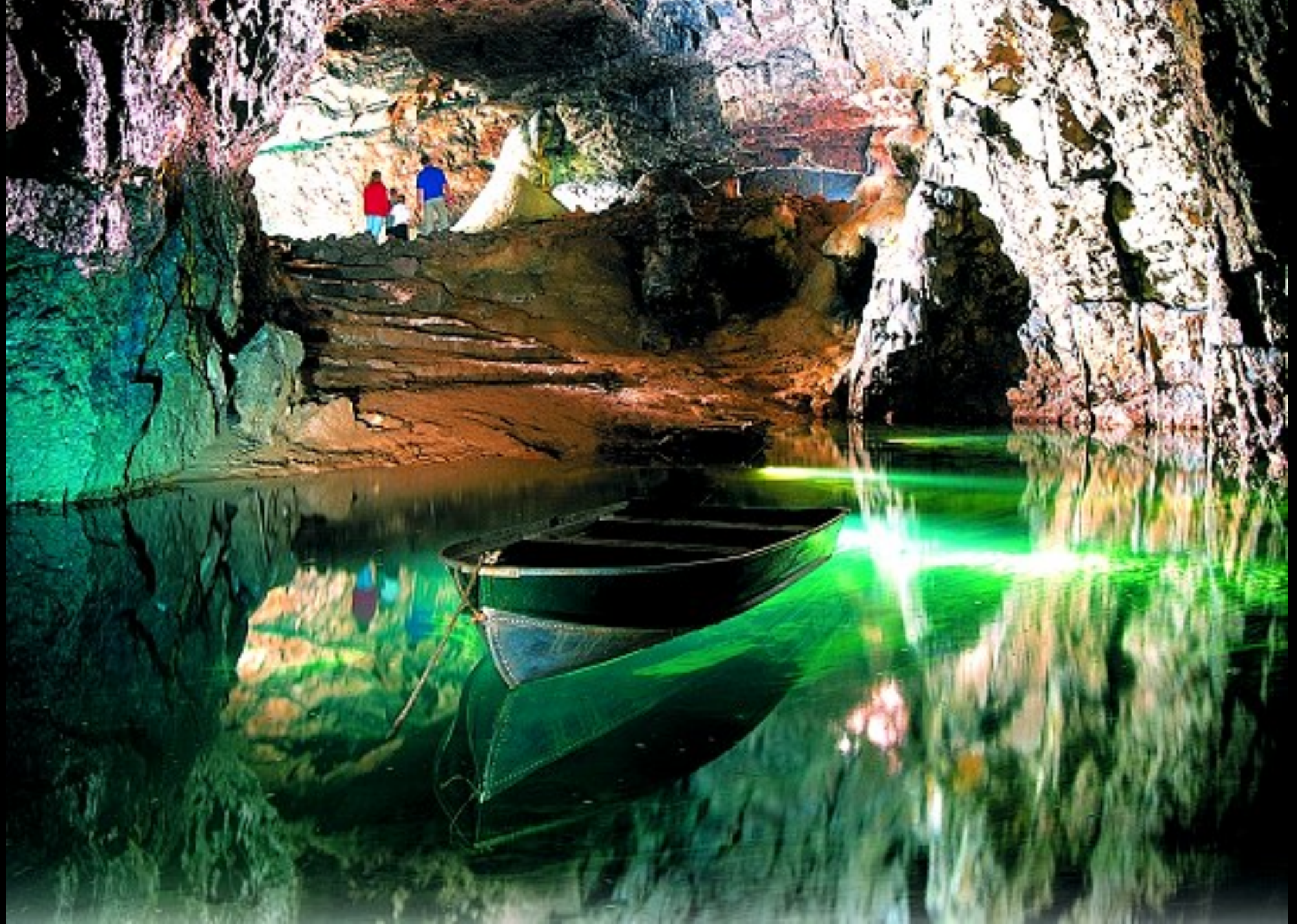
WOOKEY HOLE, SOMERSET, UK